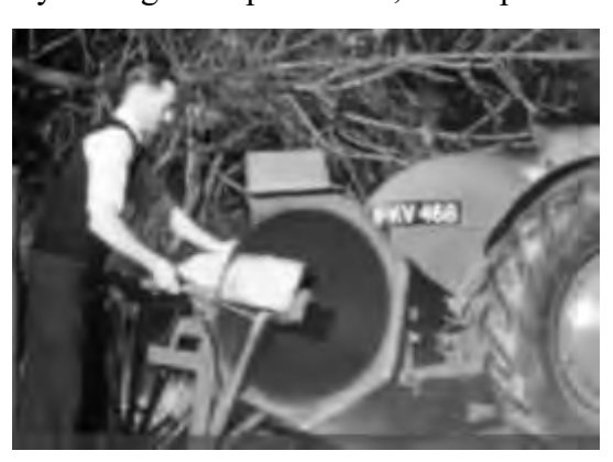
Fitted with a circular saw – and no safety guards!

Until that point, the tractor had simply been a replacement for the horse, towing carts and implements behind. On the TE-20, a pair of short hydraulic arms projected from behind the driver's seat, which could raise or lower two linkage-bars; and close behind the back axle was the third point, the tow-bar. By raising the top two bars, the implement behind the tractor – which could be a plough, harrow, seed-