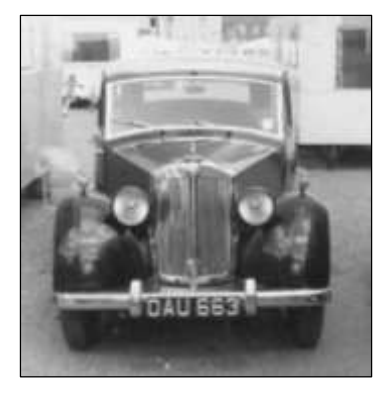
Russ's original Razoredge

I didn't know any one with a MIG welder back then and couldn't afford to pay any one to repair it. MIGs weren't as cheap and plentiful as they are now. I kept it in a lock-up garage a short distance from the house, going and starting it up now and then, but it got longer in between visits. Then a valve stuck down, which I freed off, but I knew the body was slowly deteriorating.