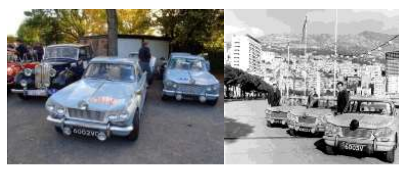
Dirk's Renown alongside two early Herald Vitesse works rally cars, and the same cars in Monte Carlo in January 1963.

As oldest car we were given the honour to leave the car park at the Plough first, leading the 104 cars out of trafficcongested London during Friday evening rush hour. Being also the slowest car of the pack we had a great view of nearly all the other Triumphs overtaking us. However we were still making good progress; it was only on our way to the second control point that we got delayed having been caught out and been forced