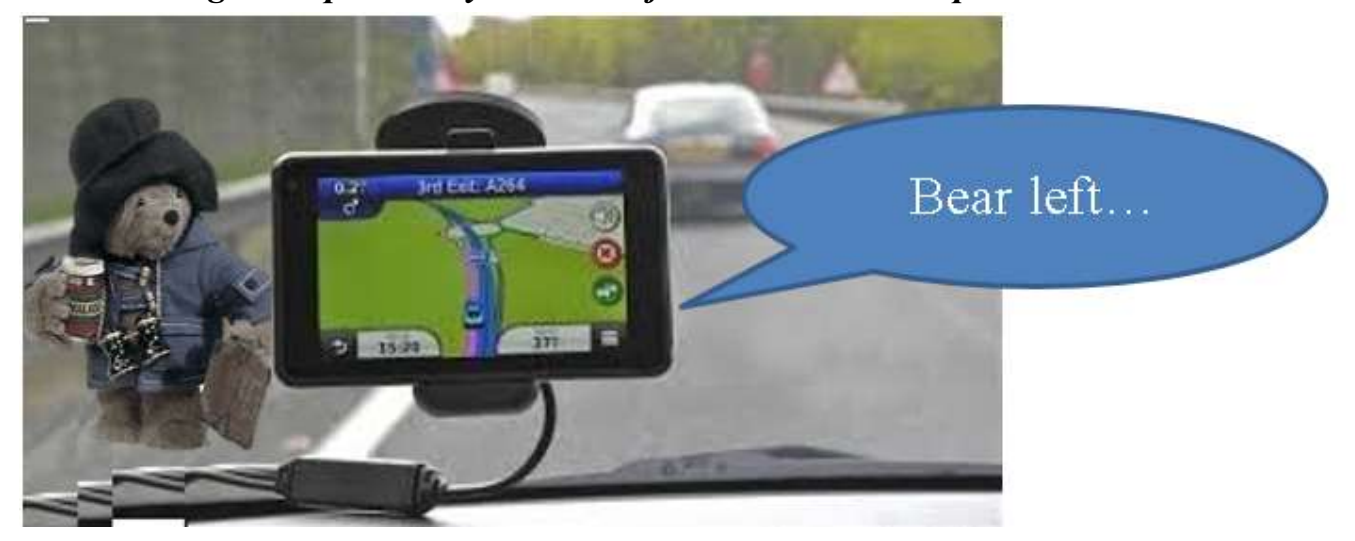
PS – the new film 'Paddington' is highly to be recommended, and not just for children.