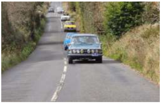
Leading a mile of Triumphs

them to bring spares but am not sure now I have expressed my thanks at the time. We were all getting a bit blurry-eyed by then. I think he must have thought of us as a wild bunch.